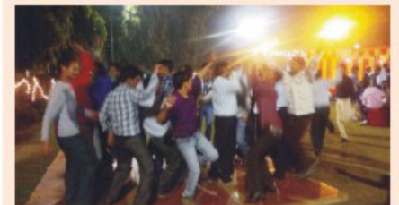
Employees loosen up & chill!

All work & no play makes Jack a dull boy" says the Gurus & the top brass at Raheja couldn't agree more! Result? A glorious, fun-filled party at Sainik farms where the entire Raheja gang participated with full zest & energy!