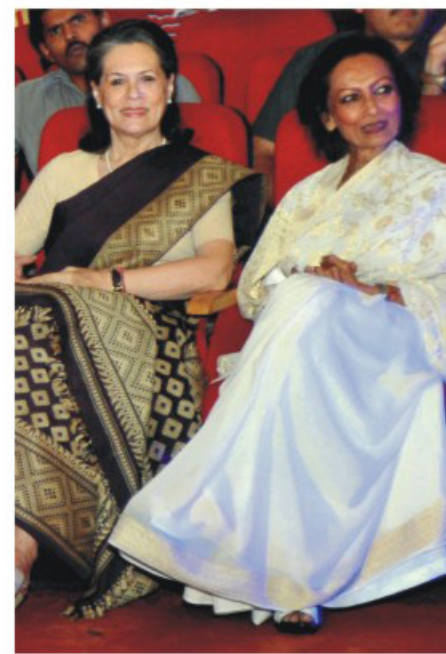
Mrs. Sonia Gandhi and Chitra Singh enjoying the evening's entertainment

event and enjoyed the musical evening which turned out to be a huge success.